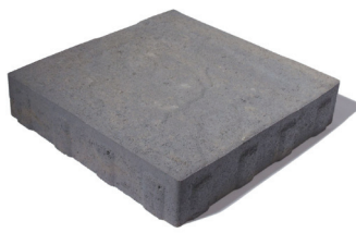
Square Length: 330 mm (13") Width: 330 mm (13") Thickness: 70 mm (2.76")