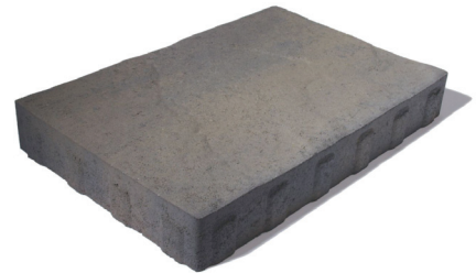
Large Rectangle Length: 495 mm (19.5") Width: 330 mm (13") Thickness: 70 mm (2.76")