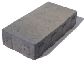
Small Rectangle Length: 330 mm (13") Width: 165 mm (6.5") Thickness: 70 mm (2.76")